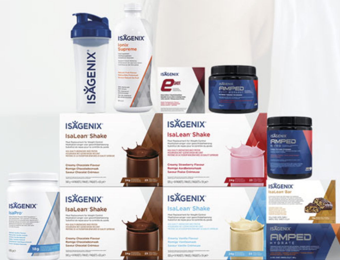
Energy & Performance